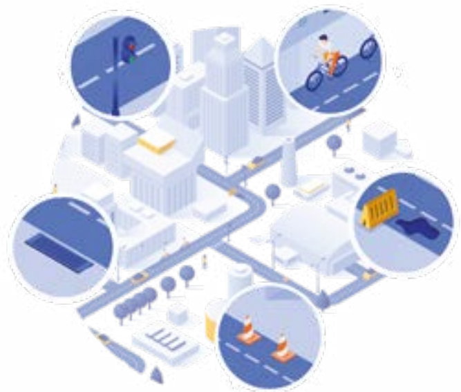
from the center - right